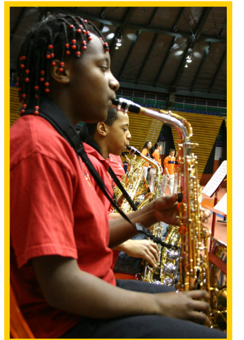
Star Utter on alto saxo-

By the end of the day, it was clear that the Signature Syracuse Jazz Ensemble impressed the crowd of over 300 people. Manley Field House echoed with cheers from the entire audience for the players - of both basketball and musical degrees. 🎵